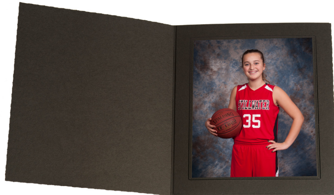
5x7 or 8x10 photo in folder