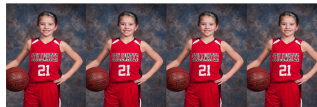
Wallets or Magnets (set of 4)