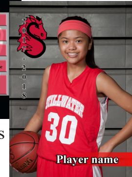
Trading cards 16